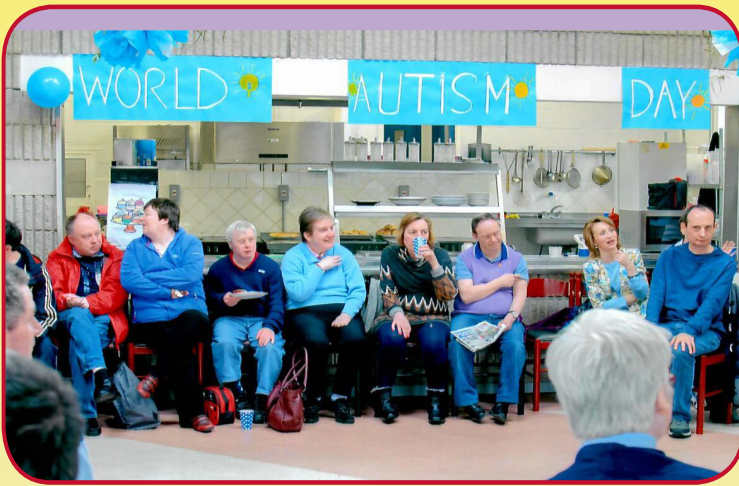
World Autism Day