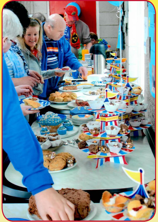
Tea Party 19 Davin Gdns