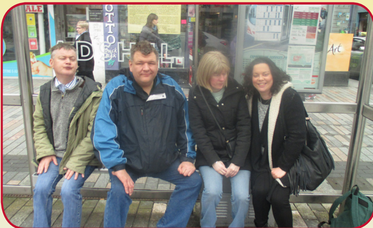
CORK BUS STOP